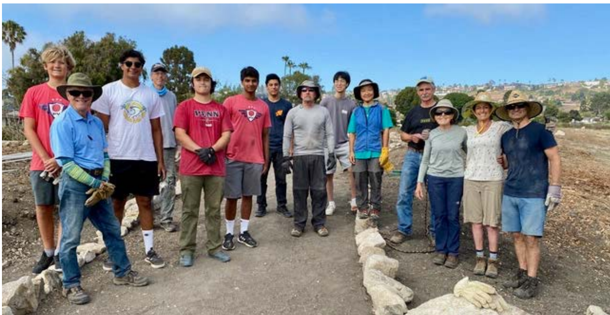
Volunteers gather at the end of the completed trail at its intersection with Paseo Del Mar.