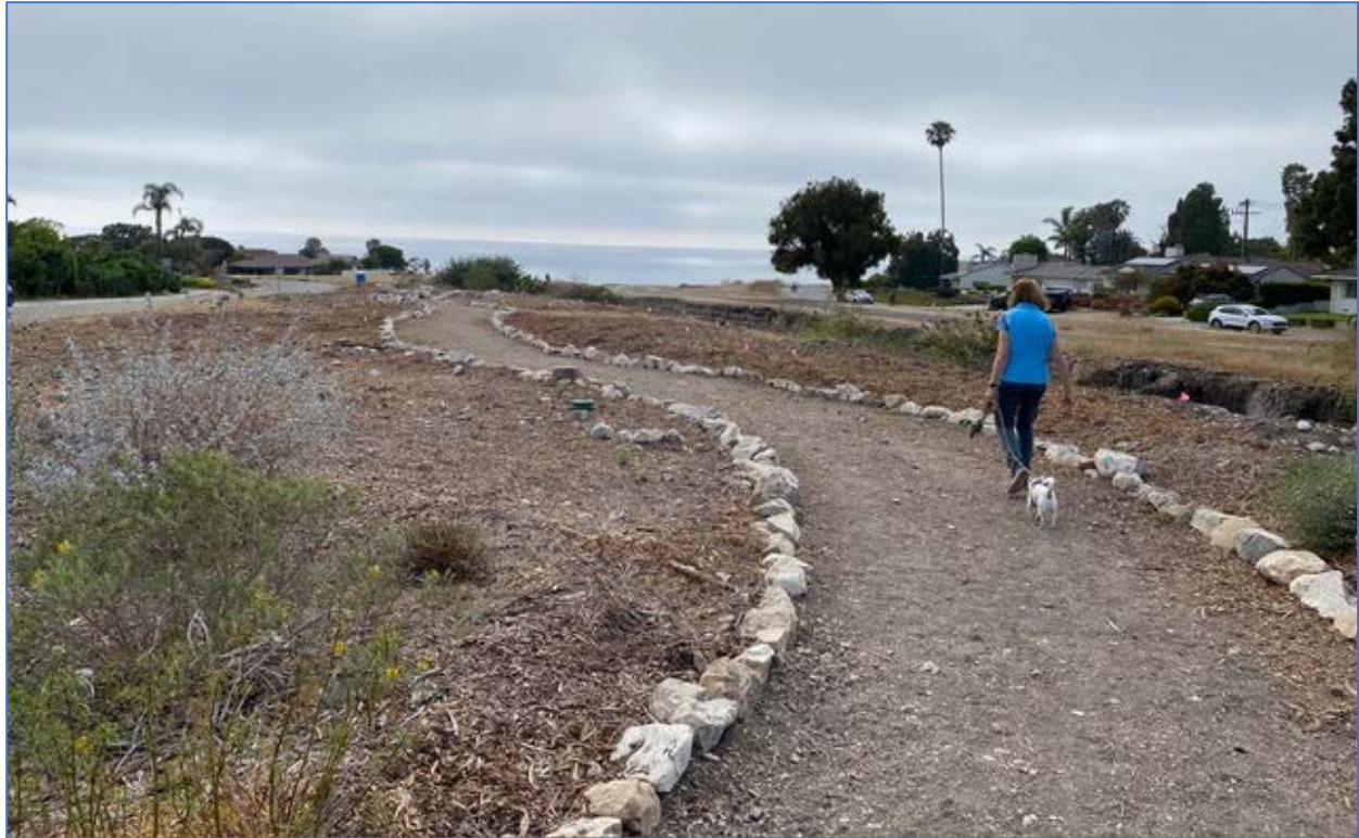
The lined trail.

The BLB team sincerely appreciates the help Troop 258 and all of our volunteers have provided to our trail-building effort. Their efforts have created the artfully-laid trail boundary you can see now. Walk the trail and take a look.