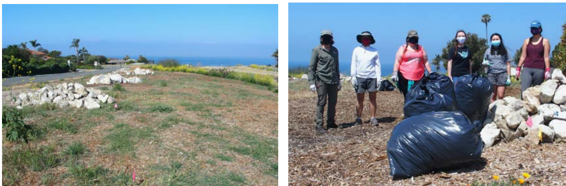
Left, Rocks piled at the Phase 2 site; Right, Weeders and bags of weeds at the site.

We’ve already begun preparing the site for the new plants. The city has been dumping and spreading mulch at the site (we’ve decided to forego grading the entire site), and volunteers will be seen removing invasive grasses and weeds on weekends. If you’d like to work off tensions by pulling weeds or like working with your hands in one of the most beautiful spots in the world, come join us.