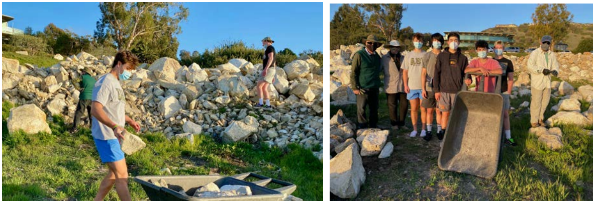
Left, Gathering rocks at the quarry; Right, The rock-gathering team.

The first major task for the Phase 2 project was selecting and moving stones from the quarry (located in Lunada Bay near the intersection of Palos Verdes Drive West and Paseo Del Mar) to the site. With the city’s permission, stone selection was completed with the help of some very strong members of the lacrosse team at Palos Verdes High School. After the stones were selected, the city moved them to the project site, where they were dumped in piles near where they will be used. City staff also moved ~25 boulders that will be placed in view areas.